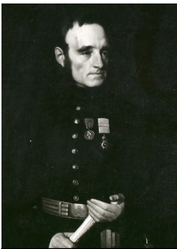
Col. G. Gawler

With a week's provisions and two barrels of water, this party started on the 11th, making to the north-west for a distant mountain, which Gawler at once named Mount Bryan, after his young friend. Beyond the river scrub, on the higher level of the fossil formation, the sandy plains were not devoid of good grass. But at the first night's bivouac, thirty-two miles from the river, so much water had leaked and evaporated that a quart only could be spared for each horse. At noon next day a distant northerly range was seen rising from a valley with lofty gum-trees. These hopeful signs Sturt too truly attributed to refraction; and, seeing the failure of the water-casks, and realising that the mountains were far more distant than they appeared, he strongly urged instant return to the river. None of the others, however, could believe that the view before them was unreal. Alas! from the next hill, after a long ride westward, the 'illusion was at once dispelled. The smiling valley, the fine trees had vanished; the ranges were thrown back to unattainable distance; bare and brown stretched the level plains as far as the eye could see without a promise of water in any direction.'