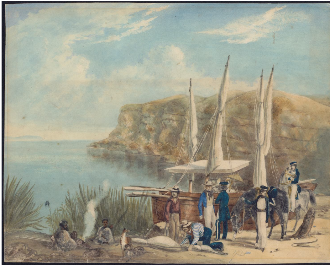
SLSA PRG50/34/6: Junction of the Murray & Lake Alexandrina 1839 by John Skipper

The plan of campaign was discussed in November 1839 by Gawler and Sturt. They proposed to cross Lake Alexandrina from Currency Creek (near the present town of Goolwa), to proceed up the Murray to the Great Bend, and thence to return overland to Adelaide. The objects in view were 'to examine the land along the river, with the hope of finding fertile country in the northern interior, and also to determine the capabilities of river and lake for inland navigation.'