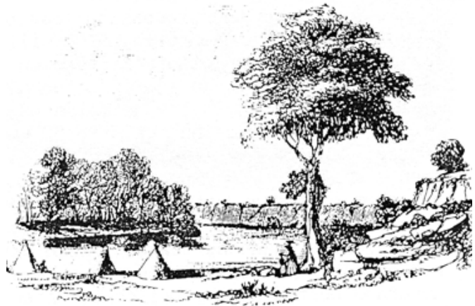
N.W. angle of the Murray. Colonel Gawler's Camp.